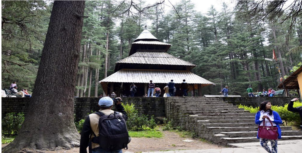
(Hadimba Devi Temple)

of magnificent deodar, is about 2.5 Kms from the Mall. It is a pleasant stroll to the temple, which was built in 1553 A.D.